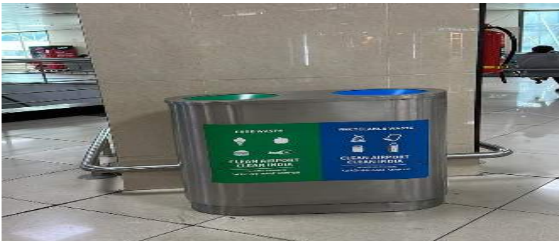
Figure 2 – Separate Waste Bins at Airports for Solid Waste and Recyclable Waste (Plastic Waste)