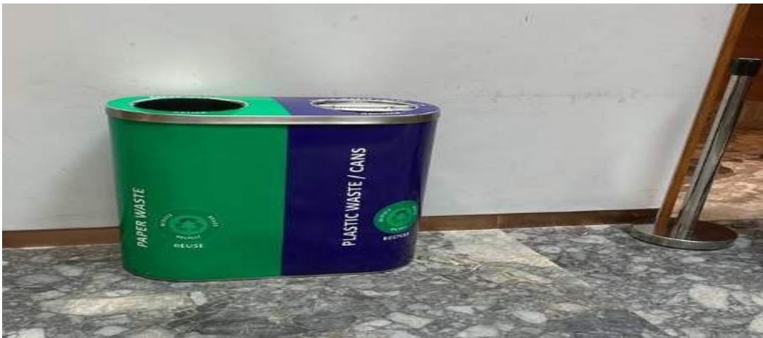
Figure I – Separate Plastic & Paper waste Bins

36. The importance and general public requirement of plastic waste management becomes evident from the fact that at all public places, in present times, dust bins have been provided where plastic waste is to be disposed of in separate bins especially specifically dedicated for plastic waste, whereas other waste is to be disposed of in separate bins. The below reproduced figures depict such separate waste bins at airports / railway stations / bus terminals/multiplexes / malls etc., and even in public parks.